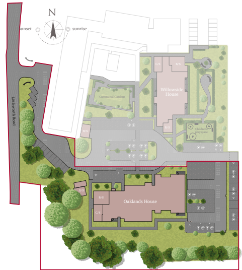
This site plan is a guide for illustrative purposes only. Landscaping shown is indicative only.